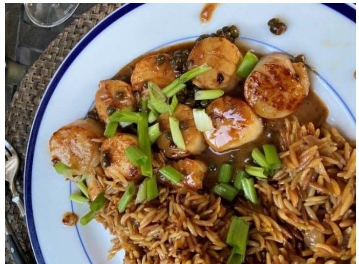
Plate the scallops, topped with a sprinkle of chopped scallions.