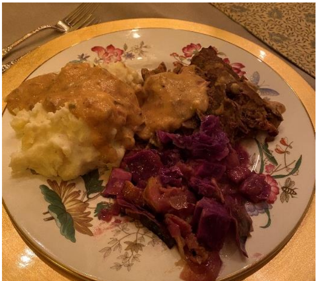
Rouladen with mashed potatoes and German sweet & sour cabbage

Note: The tricky part is to put on just enough bacon mixture on each rouladen so that you use it all up, but don't run out. You may want to count how many heaping tablespoons of filling you have