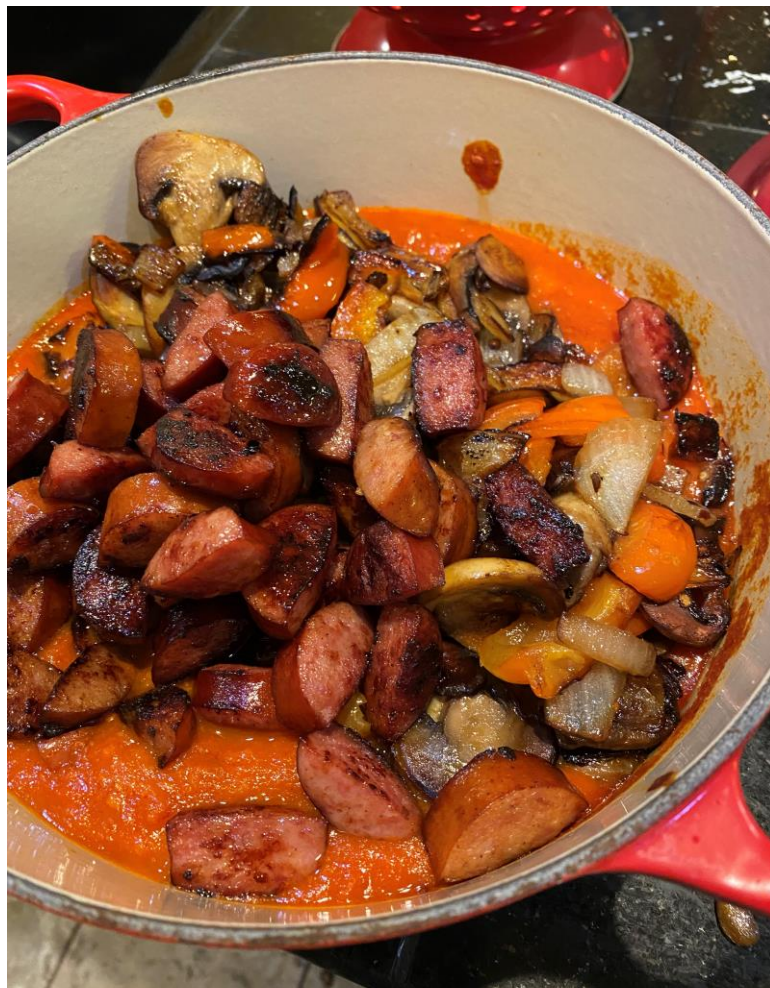
These browned kielbasa pieces and sautéed vegetables are sitting on top of the sauce before being mixed in and put in the oven.

Notes: Sounds crazy to put raw meatballs in the sauce, but it works very nicely. So long as your cook it an hour. Surprisingly, they don't release that much grease. Whatever you do, don't use store-bought cooked meatballs—terrible.