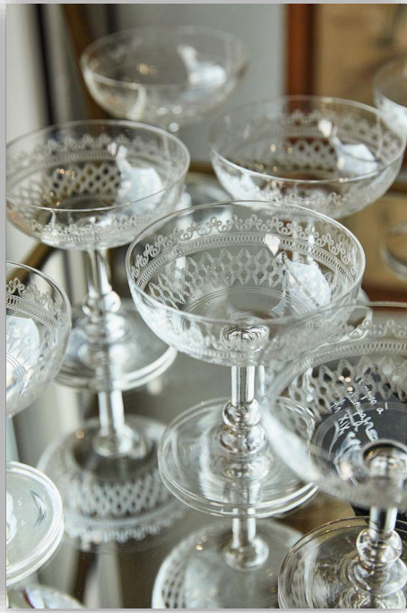
Etched coupe glasses

Coupe is a type of champagne glass with a flat bowl. The French pronounce it “coop” (with a silent “e”). It should not be confused with the other French word, coupé (with an accent mark), which refers to a sporty car and is pronounced “coop ay.”