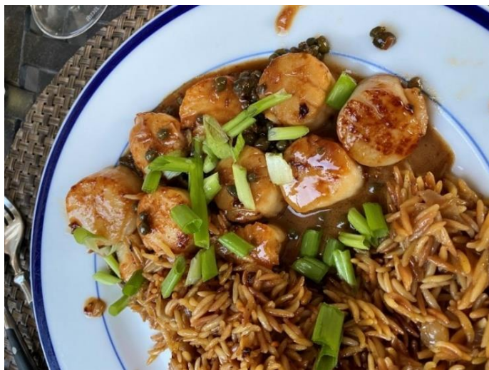
Plate the scallops, topped with a sprinkle of chopped scallions.