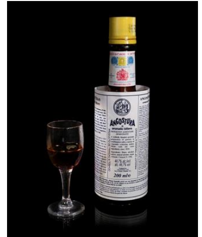
The Angostura bitters bottle is noted for its distinctive over-sized label.

See discussion under "Mexican Manhattan" on page 29.