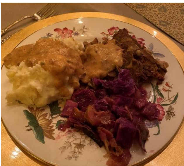
Rouladen with mashed potatoes and German sweet & sour cabbage

Note: The tricky part is to put on just enough bacon mixture on each rouladen so that you use it all up, but don't run out. You may want to count how many heaping tablespoons of filling you