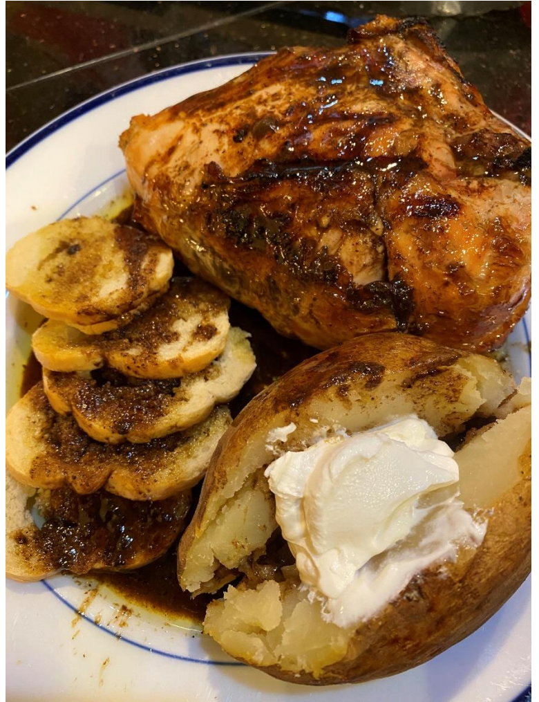
This batch happened to be made with left-over baguette slices from yesterday's dinner party. Any good bread works!

Remove the chicken, tent it and let it rest a while. (Optional: After it has rested, cut deep gashes in the chicken before saucing – allowing it will soak up more sauce.)