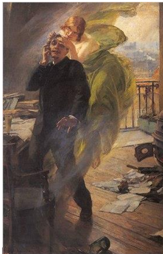
A poet succumbs to the Green Fairy.

BTW, Herbsaint and the other absinthe substitutes are liqueurs. Absinthe itself is not technically a liqueur because it has no sugar.