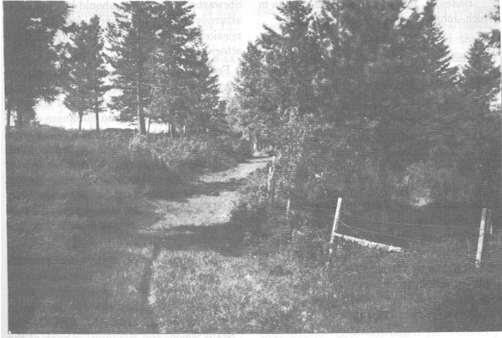
Figure 1: Photograph of “Public Road 460” published as part of the Court’s decision in Taggart v. Highway Bd. for N. Latah Cnty. , 115 Idaho 816, 820, 771 P.2d 37, 41 (1988) (Shepard, C.J.). It is difficult to see in this reproduction, but there is grass growing in this roadway.

Does a change in alignment of a road constitute abandonment of the old road? 115 The quick answer is that is a question of degree. If the current road follows the same basic path as the historic road, the change does not constitute an abandonment of the historic road. On the other hand, if the change is so fundamental that the new road “is no longer in the same location as [the] historical road” then an abandonment may occur. Adams v. United States , 3 F.3d 1254 (9 th Cir. 1993).